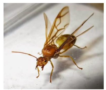
Plate 1: Tailor ant

times [1]. For example, the red forest ant, Formica rufa has a long tradition of use in remedies in Sweden and neighbouring countries and has been available as oil and acid in the pharmacies at least the seventeenth century [3]. Reports revealed that ant spirit has been used to flavor alcohol [3] for the treatment of rheumatism and back pain [4]. In southern Nigeria ethno medicine, the root bark of walnut tree is mixed with palm kernel oil and some ant extract for the treatment of rheumatoid arthritis, inflammation and bone fracture [2]. Oecophylla ants have proven to be highly effective biological control agents being capable of controlling over 50 species of insect pests in at least 12 different tropical crops [5]. More so, the use of the ant for replacement of conventional synthetic insecticide has been established in Australian cashew and mango plantations [6].