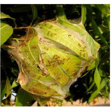
Plate 2: Tailor ant in their nest

Extracts of Oecophylla longinoda are a source of traditional Chinese and Indian medicines against arthritis and some other abnormal health conditions [7]. From the work of Oladunmoye [8], the high population of O. longinoda inhibited the infection of cocoa pod by bacteria like Proteus penneri , Serratia and Citrobacter freundii and fungi like Aspergillus aculeatinus, Penicillium chrysogenum, Chloridium chlamydosporis and Phytophthora palmivora . Meanwhile the Australian Formicine ants are also found to exhibit bactericidal properties [9]. Oecophylla longinoda generally have been found also to contain important vitmins like Vitamin B12, folate and Vitamin C [9]. Chemical constituents like alkaloids, triterpenoids, steroids have also been detected in Tailor ant [10]. The accumulation of different antibiotic resistance mechanism within the same strain has led to the appearance of the so called superbugs or multi drug resistant bacteria and this has led to the problem of resistance to antibiotics. Attention is now being shifted towards biologically active components isolated from plant and animal species for possible sources of new drugs or precursors. The study is aimed at the bioactive chemical constituents screening and antimicrobial activity of the methanol extract of Oecophylla longinoda in selected pathogens.