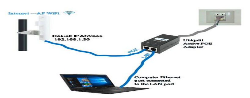
Figure 2: Experimental setup with a connected ethernet user

To carry out the measurement campaign, a measurement test-bed was set up as shown in Figure 2.