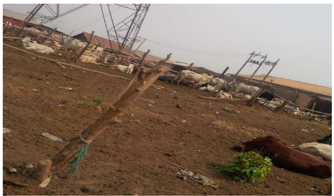
Plate 1: Pictorial view of a lariage location in Benin City